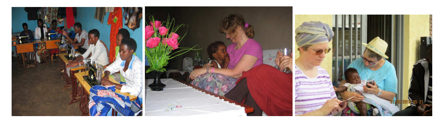
You may work with disabled children and adults. You may use your skills in origami, IT/computer tech, or sewing. You will find new children and grandchildren to hug!