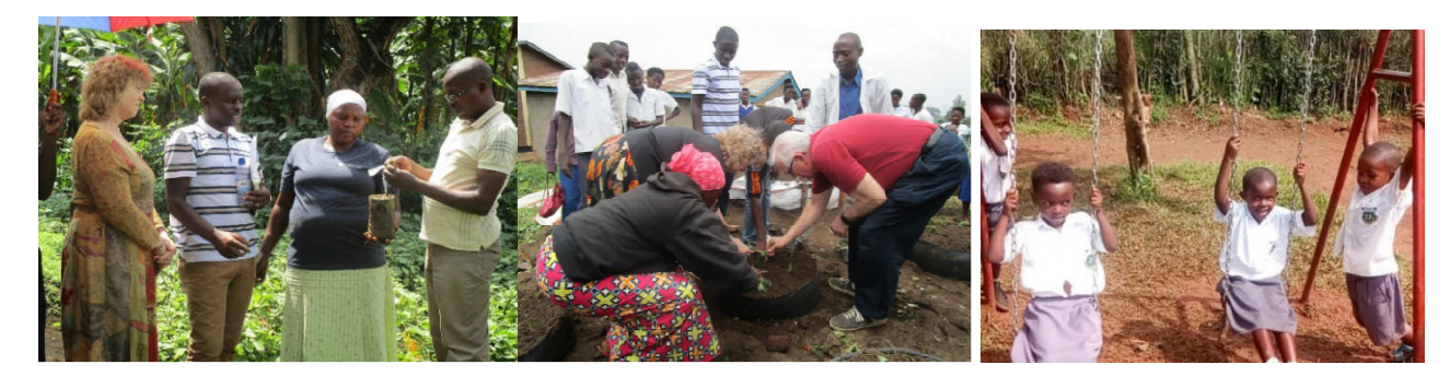
You may attend a "Cross Workshop", a unique experience of healing and forgiveness, or visit a Reconciliation Village, where former enemies, victims and perpetrators of violence, live side by side.