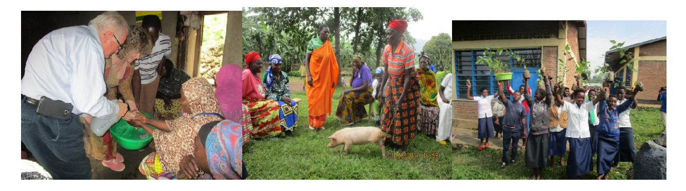
You may take part in tree-grafting, planting community gardens and replanting deforested hillsides.